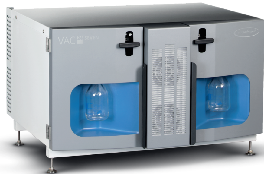
VAC 24seven pump module