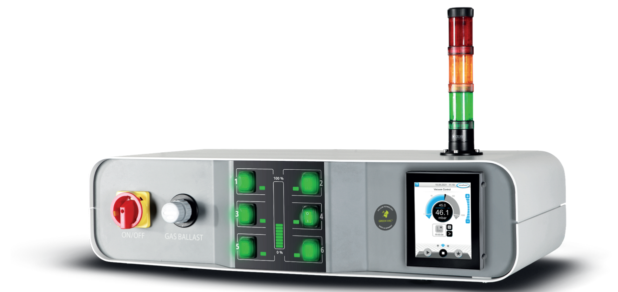
VAC 24seven control module